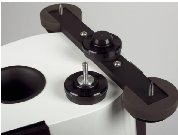
The standard spikes can be replaced with decoupling feet – definitely recommended

A word about pricing. Given the runaway madness concerning price trends in the upper echelons of models offered by manufacturers in the high-end segment,