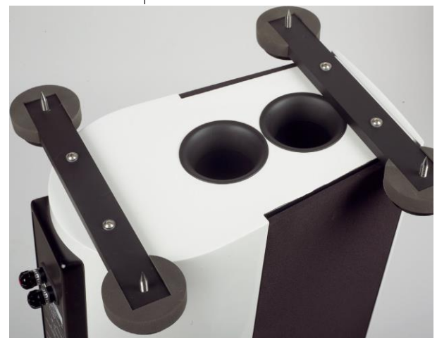
The four woofers in the loudspeakers breathe through two tubes on the base

Cabinet dampening is also a big issue when it comes to sound quality. Manni started experimenting again and – you guessed it – he found a material that no one else had on their radar screen: a very special ceramic foam. It is not as flexible as mats made of polyester batting, and it has to be mounted as a fitted part when assembling the cabinet – it's not something you can install afterwards, which is why there is no upgrade kit to the plus version.