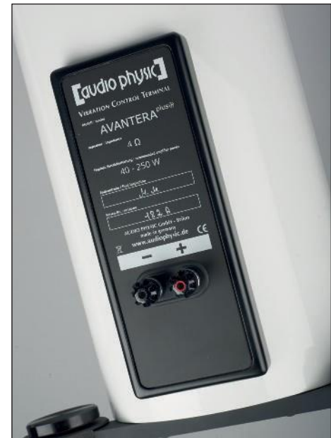
Cables are connected via mechanically-decoupled pure silver terminals from WBT.

The cabinet configuration reveals far more than a homely MDF box. What's more, each filter is placed directly on its corresponding chassis.